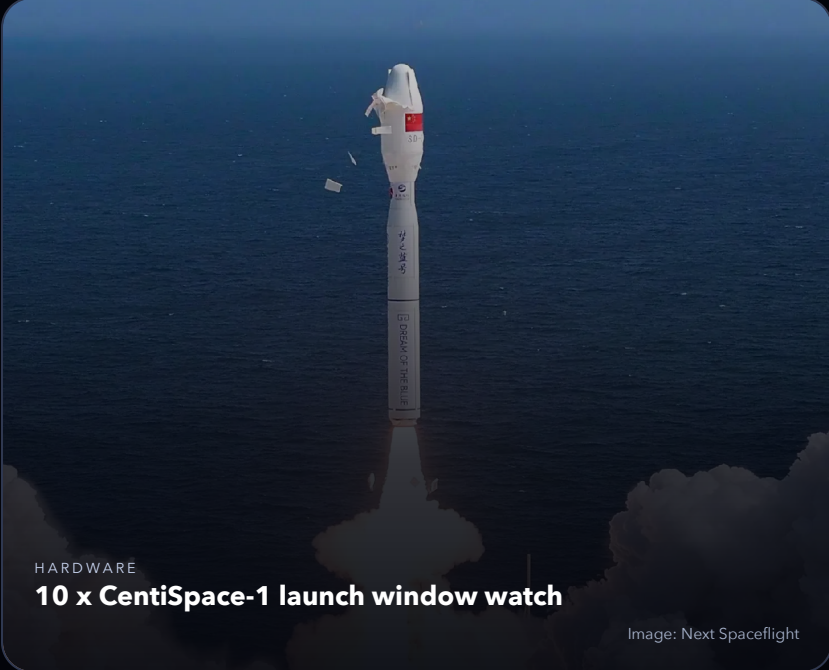
HARDWARE 10 x CentiSpace-1 launch window watch