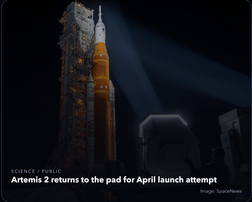
SCIENCE / PUBLIC Artemis 2 returns to the pad for April launch attempt