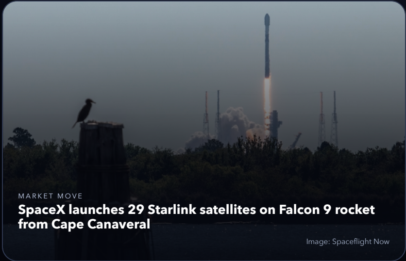
MARKET MOVE SpaceX launches 29 Starlink satellites on Falcon 9 rocket from Cape Canaveral