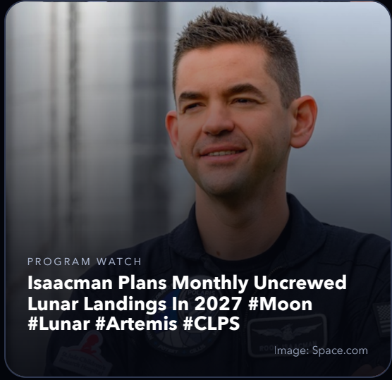
PROGRAM WATCH Isaacman Plans Monthly Uncrewed Lunar Landings In 2027 #Moon #Lunar #Artemis #CLPS