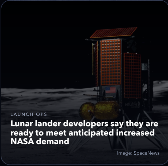
LAUNCH OPS Lunar lander developers say they are ready to meet anticipated increased NASA demand