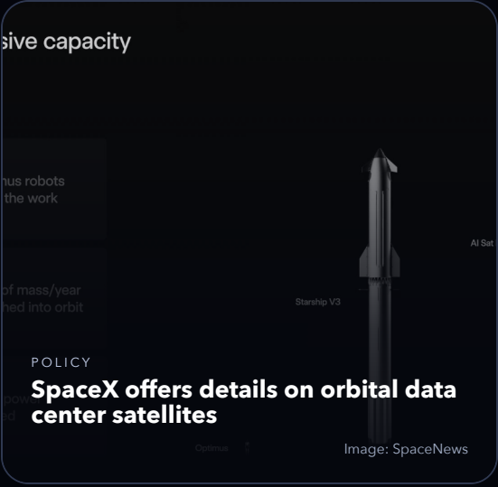
POLICY SpaceX offers details on orbital data center satellites