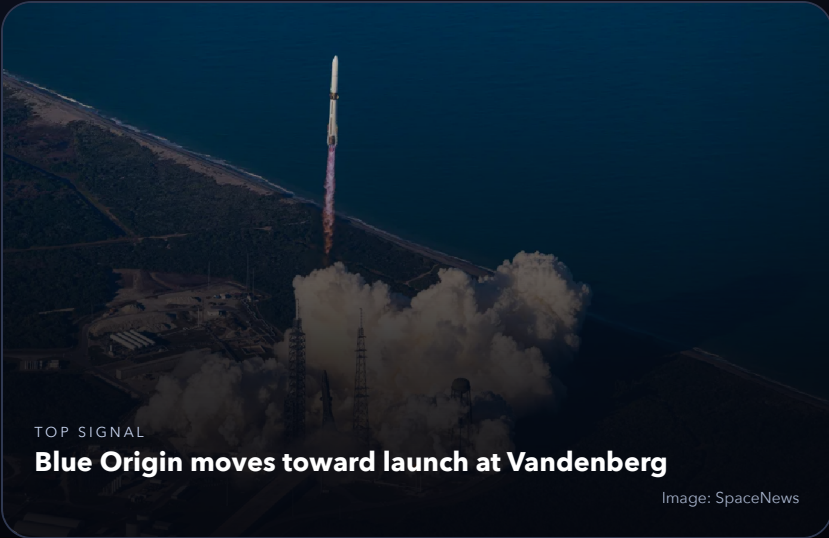
TOP SIGNAL Blue Origin moves toward launch at Vandenberg

Blue Origin moves toward launch at Vandenberg COLORADO SPRINGS - Blue Origin moved a step closer to launching New Glenn rockets from Vandenberg Space Force Base with a U. S. Space Force decision to conduct final negotiations of a lease for Space Launch Complex (SLC)-14. "By taking the next steps to further develop heavy and super-heavy space launch capabilities at SLC-14, we're continuing to unleash our capacity to execute full-spectrum space operations for the nation," Col.