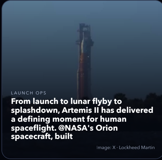
LAUNCH OPS From launch to lunar flyby to splashdown, Artemis II has delivered a defining moment for human spaceflight. @NASA's Orion spacecraft, built