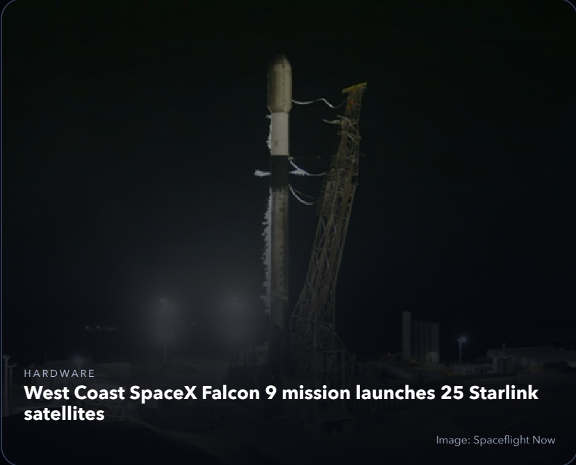
HARDWARE West Coast SpaceX Falcon 9 mission launches 25 Starlink satellites