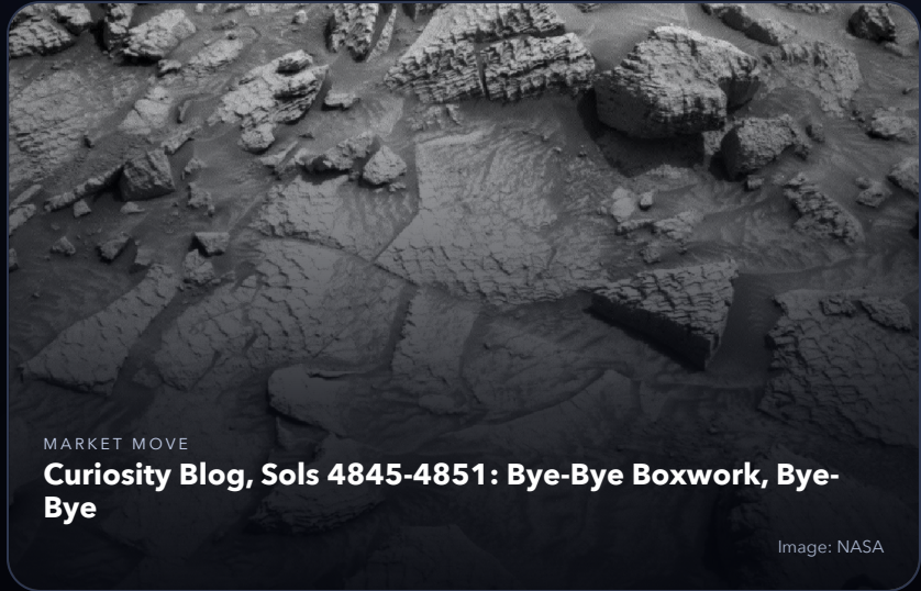
MARKET MOVE Curiosity Blog, Sols 4845-4851: Bye-Bye Boxwork, Bye-Bye