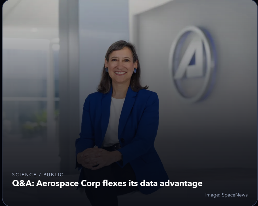
SCIENCE / PUBLIC Q&A: Aerospace Corp flexes its data advantage