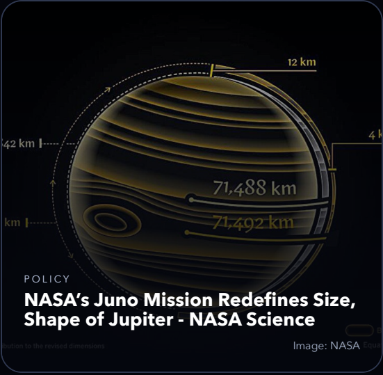
POLICY NASA's Juno Mission Redefines Size, Shape of Jupiter - NASA Science