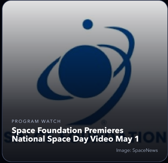
PROGRAM WATCH Space Foundation Premieres National Space Day Video May 1