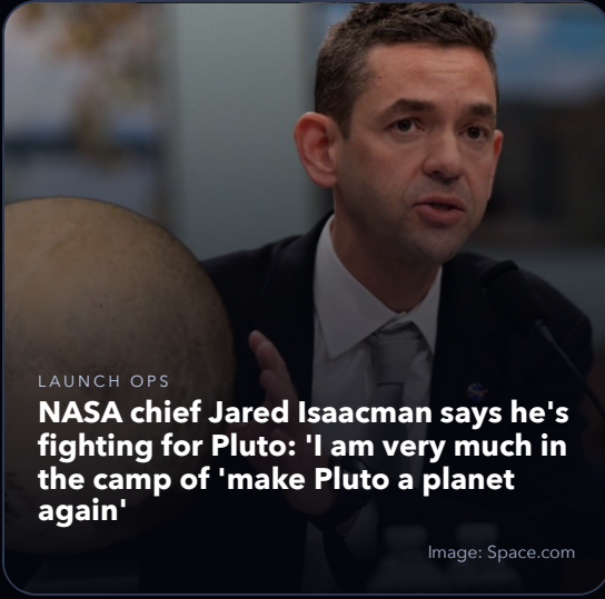
LAUNCH OPS NASA chief Jared Isaacman says he's fighting for Pluto: 'I am very much in the camp of 'make Pluto a planet again'