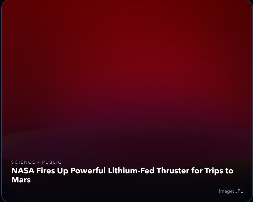
SCIENCE / PUBLIC NASA Fires Up Powerful Lithium-Fed Thruster for Trips to Mars