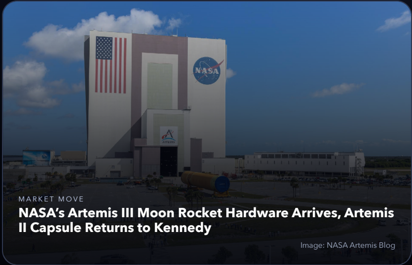
MARKET MOVE NASA's Artemis III Moon Rocket Hardware Arrives, Artemis II Capsule Returns to Kennedy