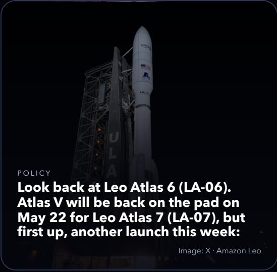
POLICY Look back at Leo Atlas 6 (LA-06). Atlas V will be back on the pad on May 22 for Leo Atlas 7 (LA-07), but first up, another launch this week: